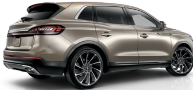
21" Premium Painted Ultra-Bright Machined Aluminum NAUTILUS RESERVE Optional