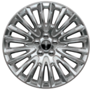
18" Warm Alloy Painted Aluminum NAUTILUS