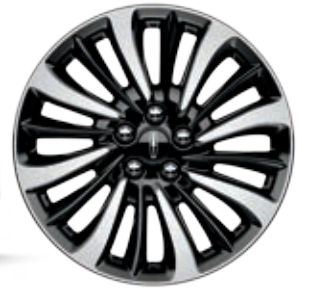
18" Premium Painted Bright-Machined Aluminum NAUTILUS SELECT