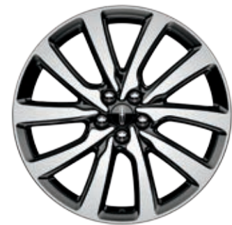
20" Premium Painted Ultra-Bright Machined Aluminum NAUTILUS SELECT Optional